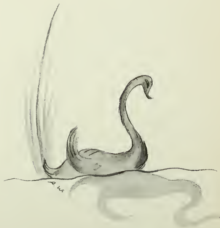
The swan on still St. Mary's lake Float double, swan and shadow.

My family was not in Kentucky long, before we motored down to the Blue Grass region of central Kentucky, where the tobacco fields ripen and world champion horses are bred. Here in a little but fa-