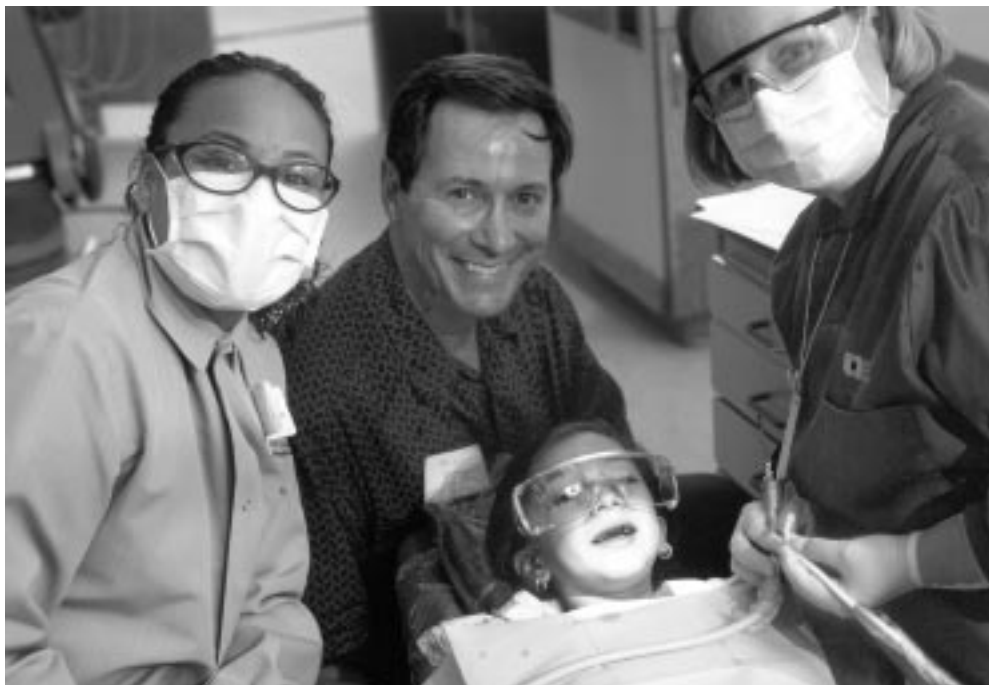
Nearly 200 children received care at Creighton through "Bright Smiles, Bright Futures."