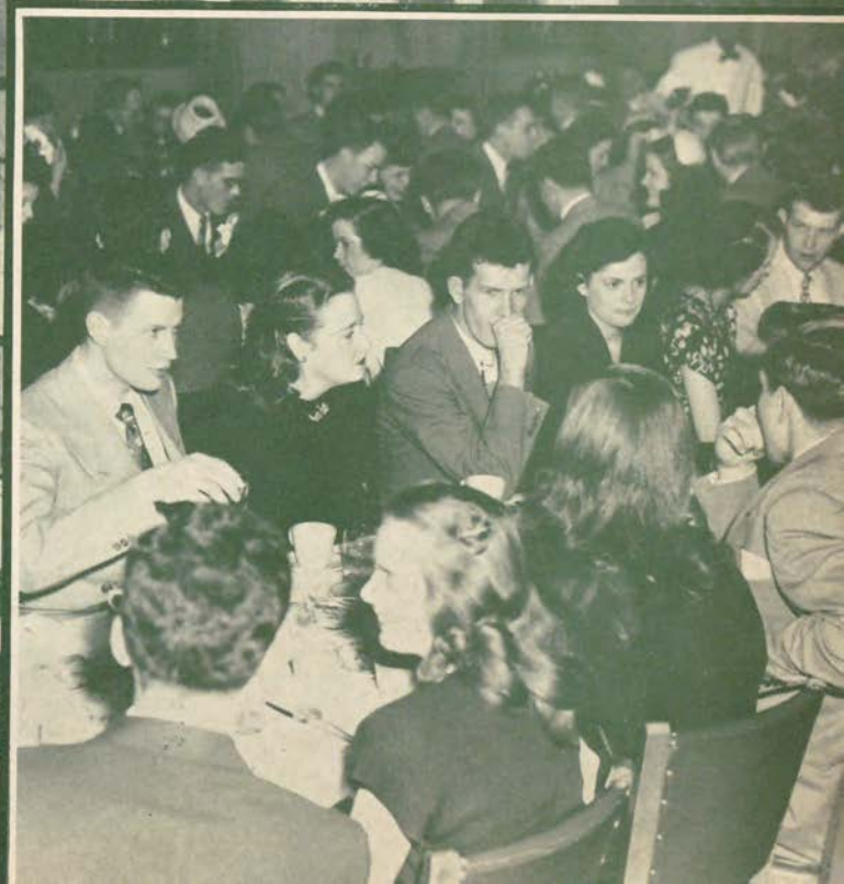
Members of the Basketball Team Enjoy Dinner at the Easter Ball