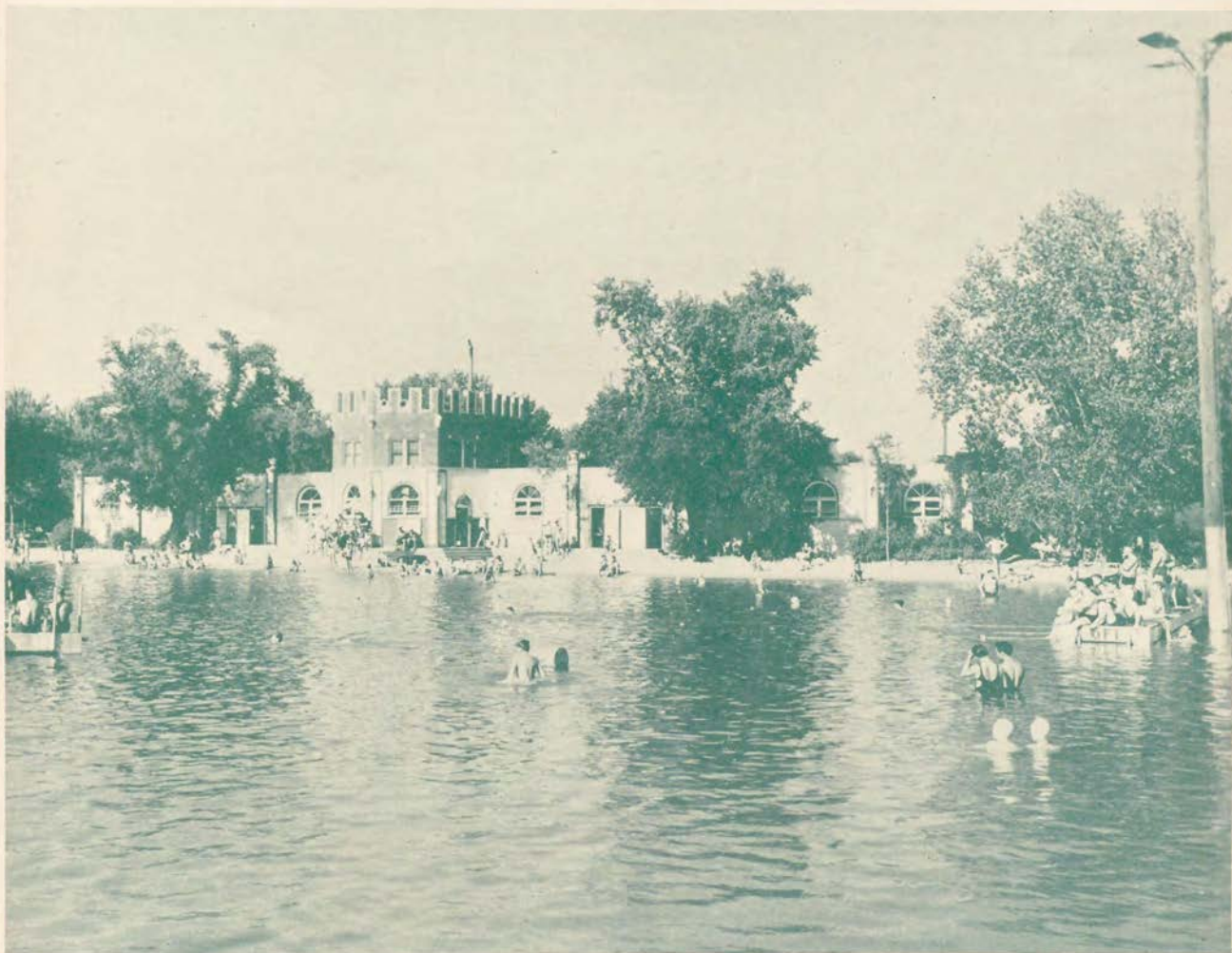
The swimming pool at Peony Park—where thousands of alumni will swim in 5,000,000 gallons of crystal clear purified water. A natural pool with a natural sand bottom, the Peony pool has seven hundred yards of sunny sand beach.

Identification badges will be prepared for each person.