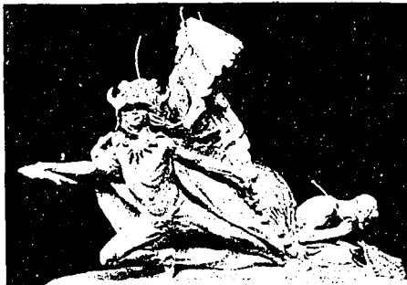
THE BUFFALO DANCE

The library now contains almost thirty thousand carefully selected volumes. New books are being added to the collection every day. The reference section is being rapidly built up, so that the library is now able to furnish information on any subject. The fact that the library has over one hun-