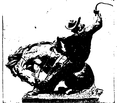
THE BUCKING BRONCHO