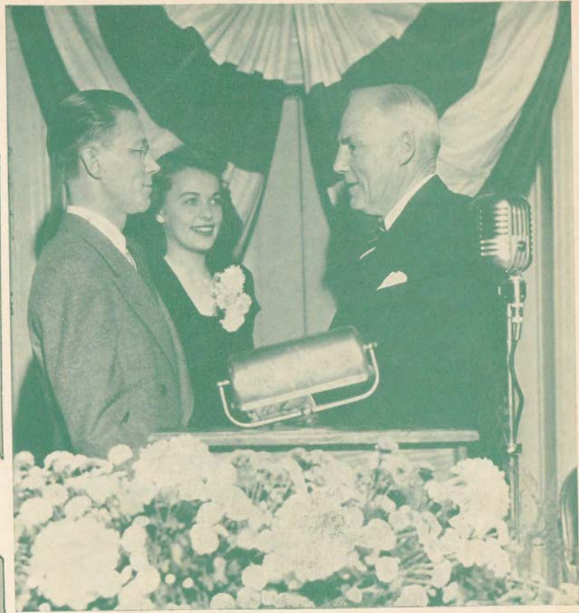
Alumni Association Presidency Changes Hands