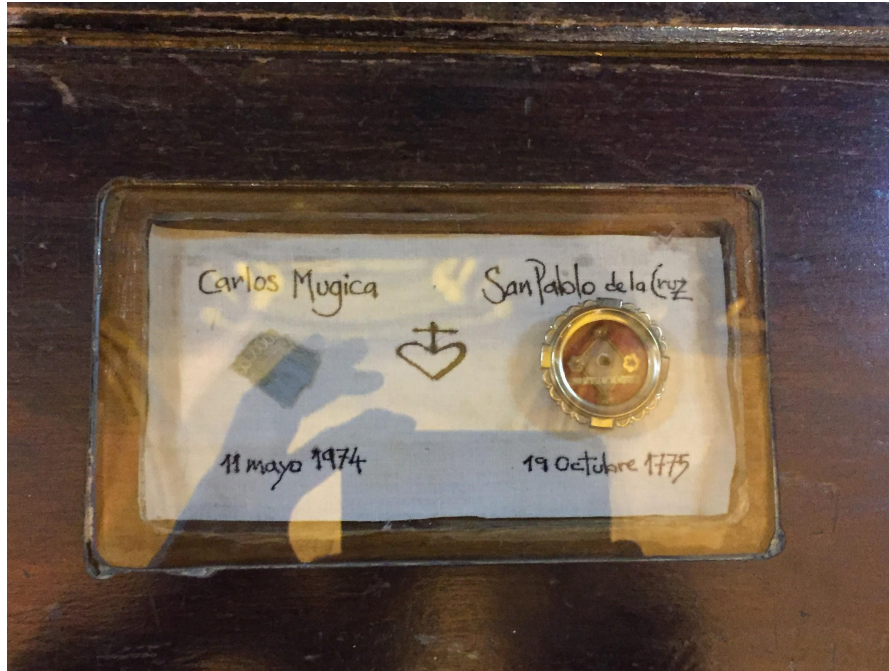
Figure 7. Reliquary

outspoken advocate of solidarity with the poor assassinated in 1974, and Saint Paul of the Cross (d. 1775), the founder of the Passionists as a contemplative order. 20