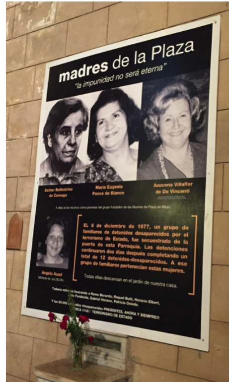
Figure 4. Madres de la Plaza