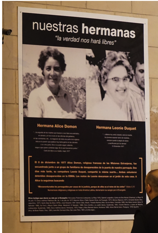
Figure 3. Nuestras hermanas