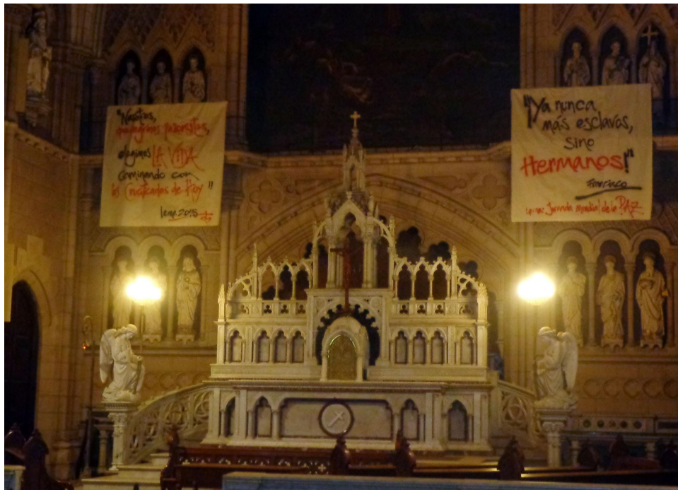
Figure 5. Traditional Altar and Worship Configuration