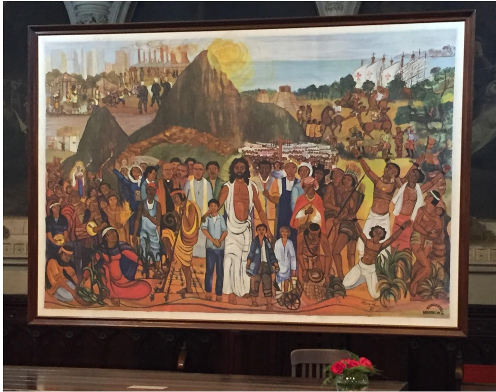
Figure 8. Esquivel Painting

armed resistance of groups like the Montoneros, which some radical priests had helped to form.