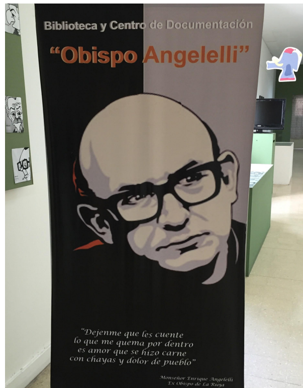
Figure 2. Obispo Angelelli

oprimidos” [the option for the poor and oppressed] of Rerum Novarum , the Argentine theology of the people, and the later Liberation Theology. The inclusion of Archbishop Romero, whom Pope Francis beatified in 2015, reinforced the prophetic claim being made on behalf of Mugica and Angelelli as martyrs of the Church entire.