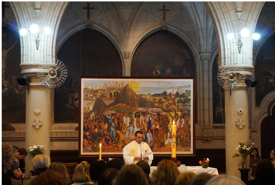
Figure 6. Second Worship Configuration in the Round

reinforced the separation and verticality of the authoritarian relation to divine power that pre-Vatican II theology emphasized. Christ and the saints stood above and behind the altar and from raised positions along the perimeter walls and in side alcove chapels to look down upon the congregation from on high. The priest stood before the altar as a living axis mundi , the mediating pivot between the human and the divine realms. This arrangement encoded the “theology of power” that Argentina’s military bishops sought to restore to the Argentine nation. The military leadership was to serve as God’s divine instrument in this reconstituting work; the military bishops spoke of national salvation.